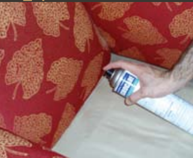
Upholstered furniture should be treated in similar fashion to the mattress with special attention paid to the tufts, folds, seams and buttons.