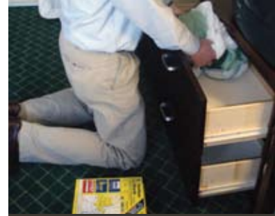
All dressers and chests should be emptied.