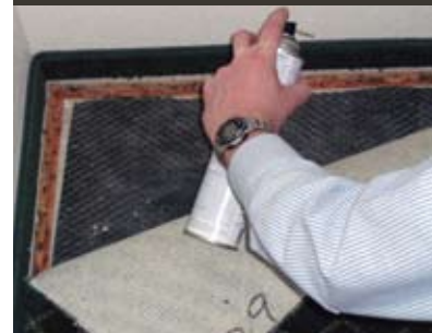
Treat the gap beneath baseboard molding around the entire room.