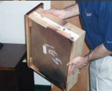
Drawers should be removed for thorough treatment including the underside and runners of the drawers.