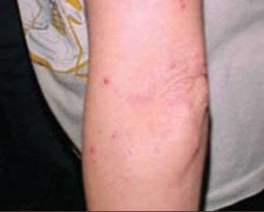
Bites may develop small white to red, hard welts at the bite site.

Bed bugs feed exclusively at night. They take approximately three to five minutes to engorge on blood. Once feeding is complete, they return to their harborage.