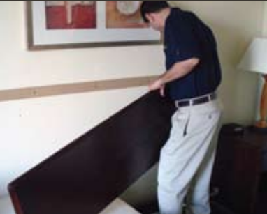
You must move and/or disassemble some items while searching for bed bugs.