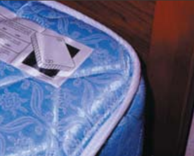
All beds should be stripped down to bare mattresses and box springs.