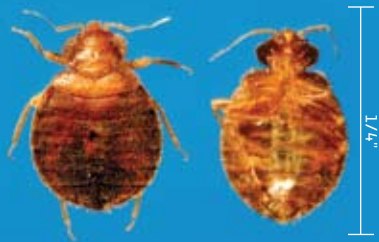
Common Bed Bug ( Cimex lectularius )

Bed bugs were nearly eradicated in North America in the 1950's with the widespread use of DDT. They remained common in many parts of the world however, and recently have made a rebound in the US. The resurgence of bed bugs has become a common pest in major metropolitan areas, particularly in hotels and residences, and are quickly spreading across the country. Many people attribute this resurgence to two things: increased international travel and a shift in pest management practices. Bed bugs are great travelers. They are quick to congregate in suitcases which are set down for a few days near infested beds, and due to their small size, usually go undetected. When the suitcase arrives home or at the next hotel, they can quickly infest their new home. The shift in pest management practices moving away from routine indoor residual sprays for pest maintenance, which was the norm during the DDT era moving toward modern methods of reduced pesticide with emphasis on pest specific baits, left a big opportunity for bed bugs to get reestablished. Since there are no effective baits for bed bugs, and the professional pest industry hasn't routinely inspected and treated for bed bugs for several decades, there was no safeguard in place to stop the reemergence of this pest.