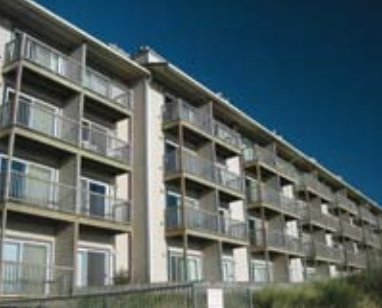
Bed bugs are found in all types of dwellings.