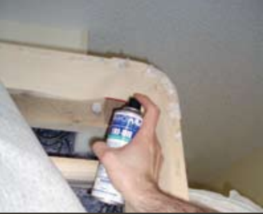
Remove the batting on the box spring for treatment inside the cavity of the box spring.