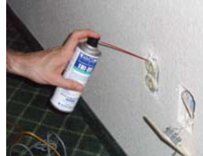
Remove utility switch plates and inject dust into the voids.