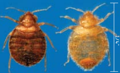
Bed bug (left) compared to bat bug (right) Note the longer hairs on the bat bug.