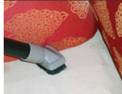
Brush attachments should be used for vacuuming in cracks and crevices.