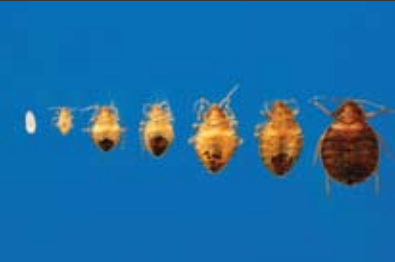
Bed Bug Lifecycle